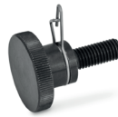
DIN 464 → Page 457 M6 ... M10