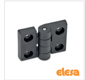
ELESA original design CFH. / CFL.