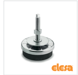
ELESA original design LW.A