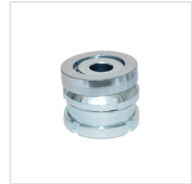
ROSTFREI® Inox Stainless Steel