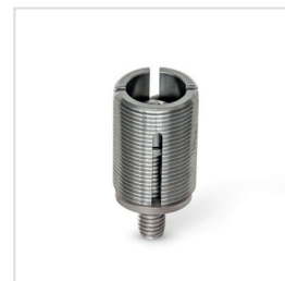
EDDELSTAHL® Rostfrei Inox Stainless Steel