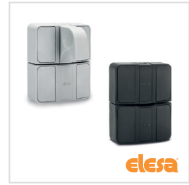
ELESA original design BMST