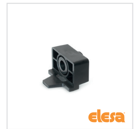
ELESA original design BPS.30-SP