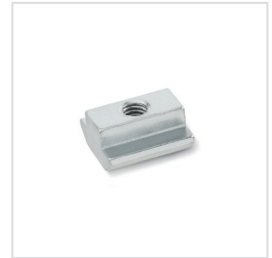
T-nuts to slide in