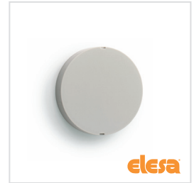
ELESA Original design CP.