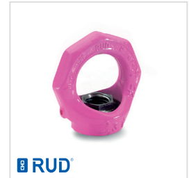
Recess for ring spanner