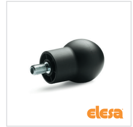
ELESA Original design EBS+x