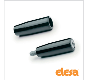
ELESA original design I.281/I.281+x-SST