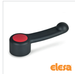
ELESA original design ELC./ELC.SST