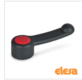
ELESA original design ELC./ELC.SST