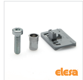
ELESA original design APC.