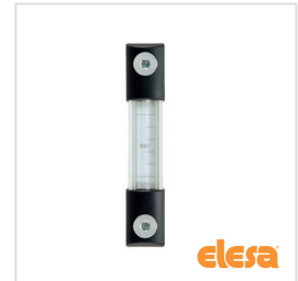
ELESA original design HCK./HCK-GL