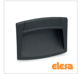
ELESA Original design EPR-PF