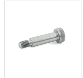
ROSTSTAHL® Rostfrei Inox Stainless Steel