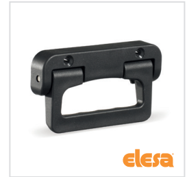
ELESA original design MPE.