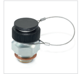
3 Type K with plastic protective cap and retaining cable