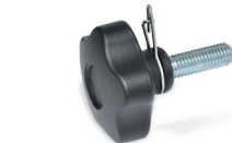
GN 5337.2 → Page 561 GN 5337.7 → Page 563 Size 32 ... 63