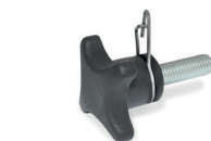
GN 6335.4 → Page 587 GN 6335.5 → Page 587 Type ST