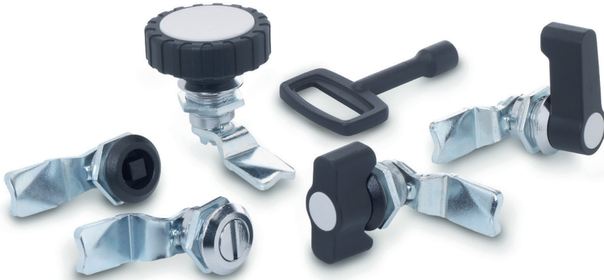
Latches, not Lockable, with Operating Elements GN 115 Latches, not Lockable, with Socket Keys GN 115 → Page 1202 Socket Keys GN 119.2 → Page 1266