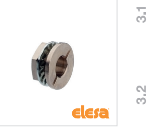
ELESA original design: GG-VCK