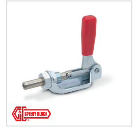
2 Type AS Sheet metal body